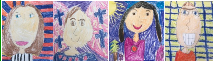
Some of our self portraits from our portfolios!